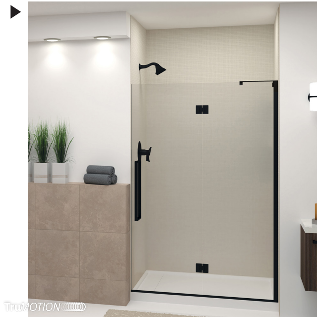
SMEHT-48247610C-MB ▶ ETHAN TYPE E

Type E includes glass mounted door and one stationary panel with "L" bracket.