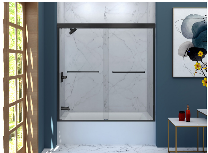
SMCBP606006C-BS CECELIA BY-PASS TUB DOOR