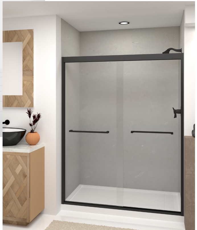
SMFBPT607608C-MB ▶ FRANKLIN BY-PASS DOOR SMMH-BPD-S-MB SAMPSON HANDLE