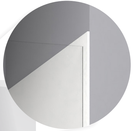
Clear Vinyl seal, implimented for each Ethan SHOWER DOOR

Type A includes wall mounted door only. Clear vinyl seal on the door gives a 3/8" out-of-plumb adjustment.