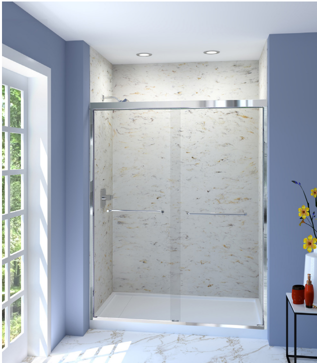
◀ SMCBP607606C-BS CECELIA BY-PASS DOOR