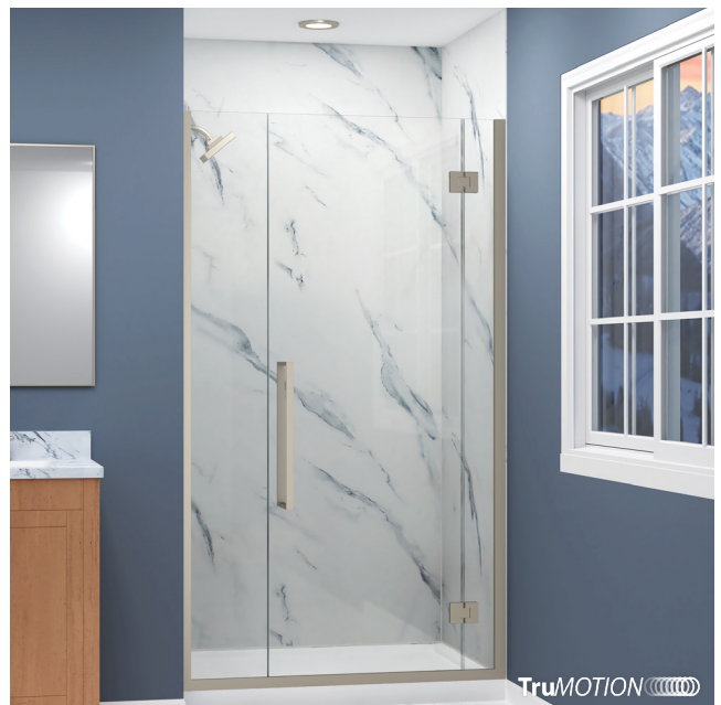
SMEHTD-48247610C-BS ▶ ETHAN TYPE D

Side wall profiles on the stationary panels allow up to 1" out-of-plumb adjustment (1/2" on each side). Various door opening sizes available.