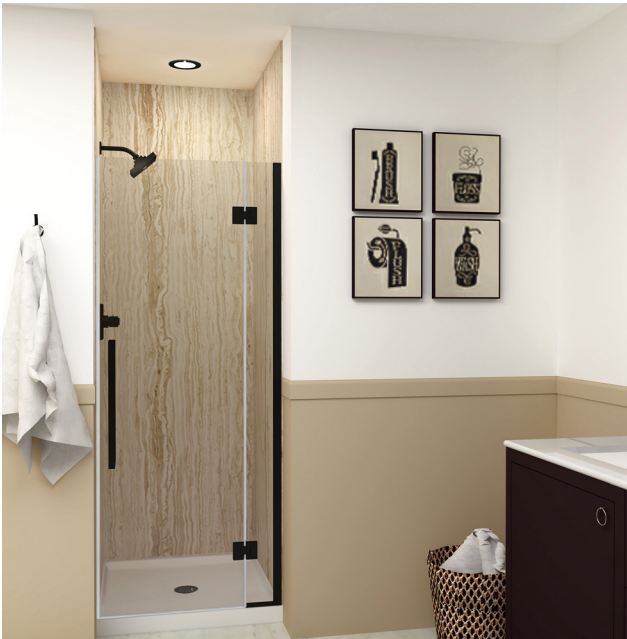
◀ SMEHTC-30247610C-MB ETHAN TYPE C

Hinges are heavy duty 304 stainless steel. Special Nano Protection surface treatment that keeps glass looking clean. 3/8" (10mm) thick glass.