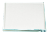
Low Iron Glass