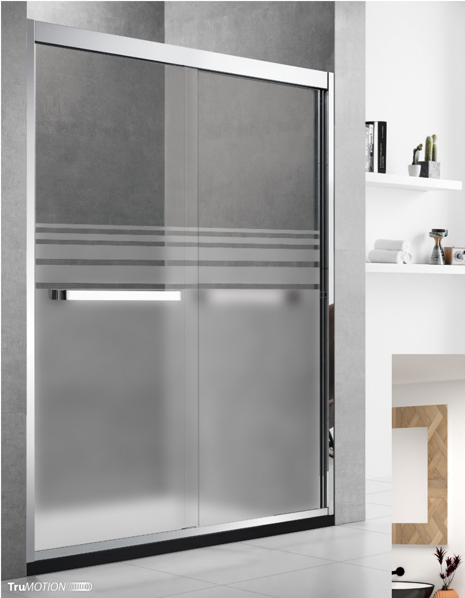
◀ SMFBPT607608F-BS FRANKLIN BY-PASS DOOR

Selective handles from Pinnacle, Diamond and Meridian Series available for use with these doors.