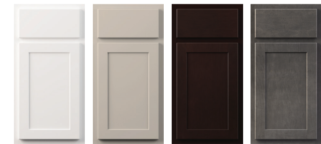
White Paint Pewter Paint Dark Sable Stain Grey Stain