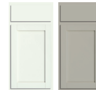
Pearl SmartShield Cinder SmartShield