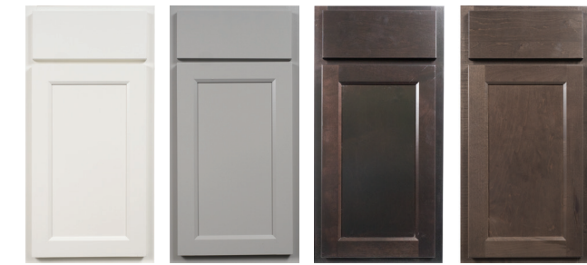
White Paint Haze Paint Espresso Stain Graphite Stain